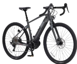
E-gravel bike (electrically assisted) 7,000 yen/day (tax included)