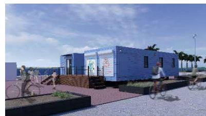
Appearance image of Bentenjima Cycle Gate