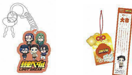
Acrylic keychain and omikuji slip