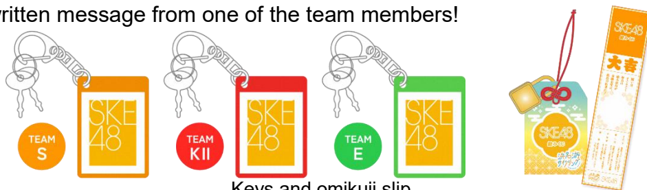
Keys and omikuji slip

* All images are for illustrative purposes only.