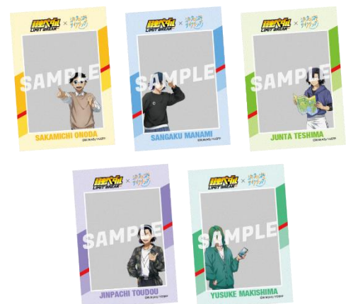
“Yowamushi Pedal” photo frame-style clear cards

For details, please check the website ( https://recommend.jp-central.co.jp/hamanako-cyc/yowapeda/ ) (in Japanese).