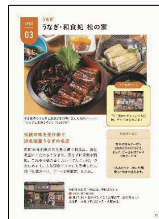
Hamanako Cycling Yuru Chare Mankitsu Coupon (partial)