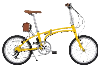
E-mini velo (electrically assisted) 4,500 yen/day (tax included)