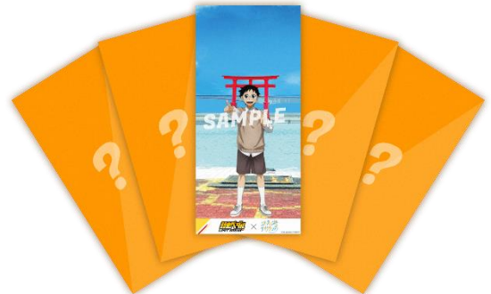
“Yowamushi Pedal” original digital wallpaper