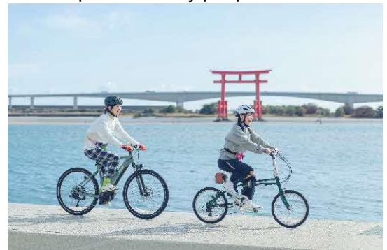
Image of Hamanako Cycling