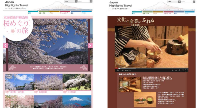
* The special feature article page will be online from October onwards. Images are for reference