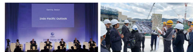
IHRA Forum (left: main conference, right: technical visit)

since the planning stage, we will continue to respond to requests from the Taiwan High Speed Rail Corporation, such as providing technical support for the procurement of new cars based on the N700S, which the Corporation has decided to procure in 2023, and contribute to the Corporation's safe and reliable transportation services.