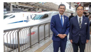
Shinkansen inspection tour by U.S. Secretary of Transportation Pete Buttigieg

For the Northeast Corridor Project, we aim to introduce SCMAGLEV in the Northeast Corridor connecting Washington D.C. and New York and are carrying out promotional activities so that the Washington DC. - Baltimore section can proceed first under the cooperation of the Japanese and U.S. governments. Currently in the U.S., the Federal Railroad Administration and other organizations are conducting environmental impact assessments with U.S. federal grants. The Japanese government is also engaged in a research project to introduce SCMAGLEV in the U.S. We intend to provide technical support when the project makes concrete progress.