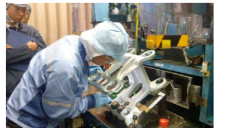
Conducting a quality audit of rolling stock components

Suppliers are "partners" with whom we work to reduce costs while maintaining and improving product quality. Establishing continuing and stable business relationships with them enables us to procure high-quality products at reasonable prices, thereby contributing to the strengthening and development of the entire railway-related business in Japan, including our suppliers.