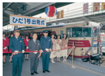
Photograph from the time of privatization "Hida #1" departure ceremony (April 1, 1987, at Nagoya Station)

Since the breakup and privatization of JNR, JR Central has steadily progressed as a private company while taking over the public and social mission that JNR had assumed.