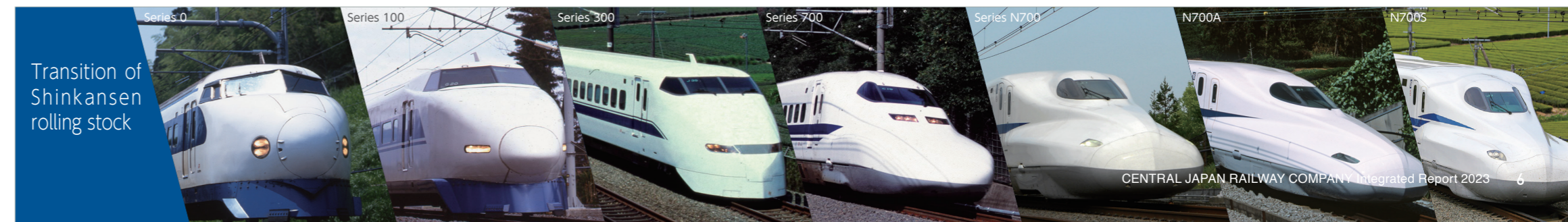
Transition of Shinkansen rolling stock